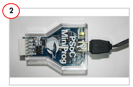
Remove the CY3217-MiniProg1 from the kit package; plug the USB cable into the USB Mini B connector and connect it to your PC.