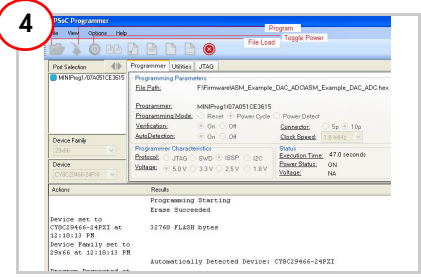
Use PSoC Programmer to program hex files on to the PSoC device. You can also use PSoC Programmer to toggle the target power provided by MiniProg 1.