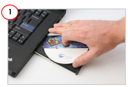
Insert the CY3217-MiniProg1 Kit CD into the CD drive of your PC.

Install the kit contents, PSoC Designer, and PSoC Programmer.